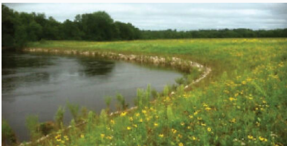
Anoka County riverbed restoration project from Anoka County Parks website.

LWVMN Position on Violence Prevention (Pages 41-42)