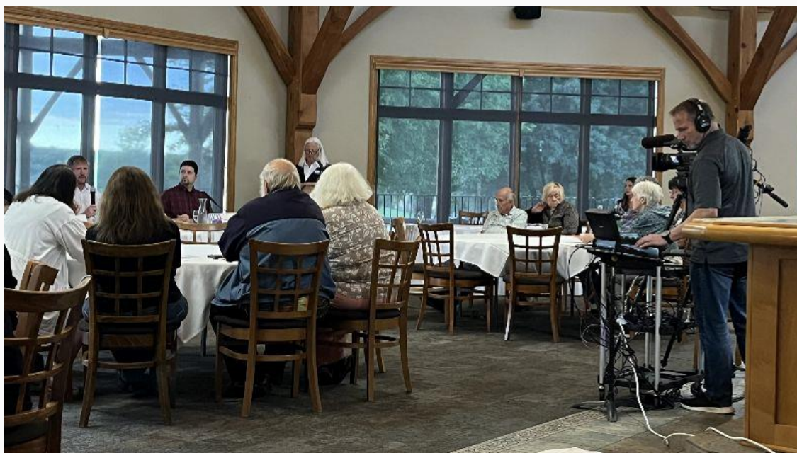
Ham Lake Area Candidate Forum, September 24, 2024.