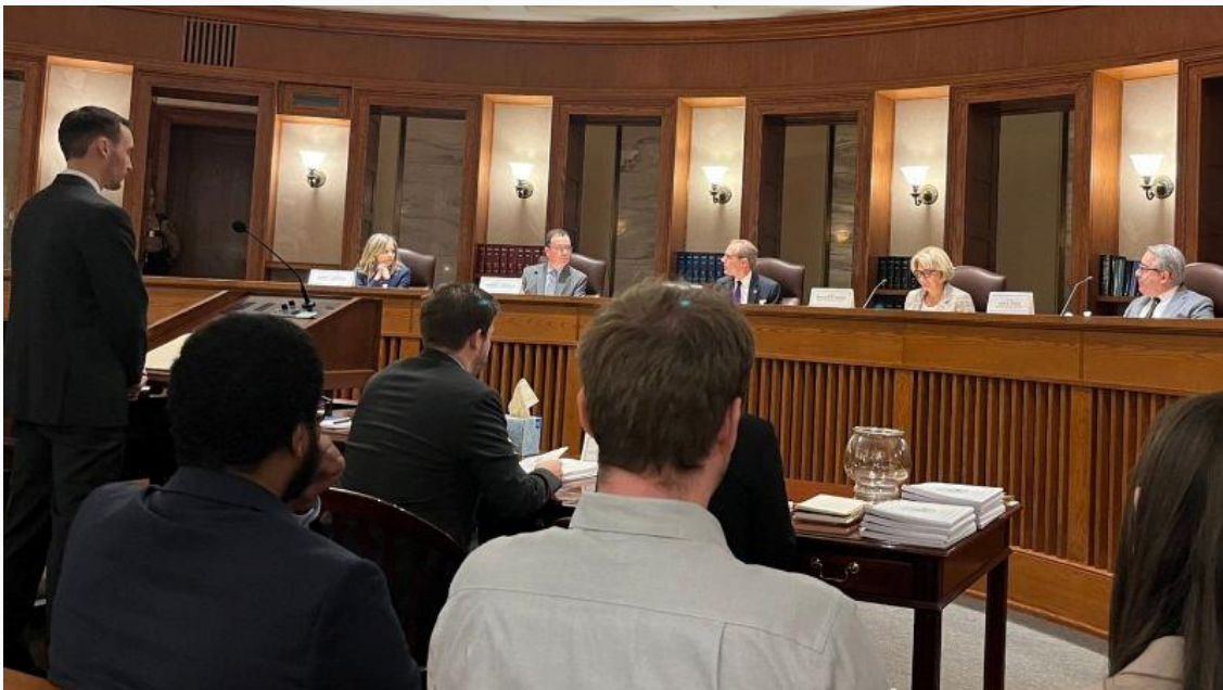
Minnesota Canvassing Board , November 24, 2024