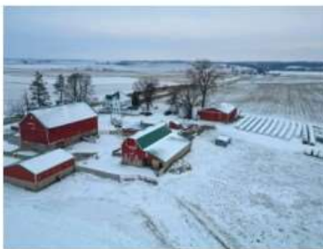
Besier-Gadient farm