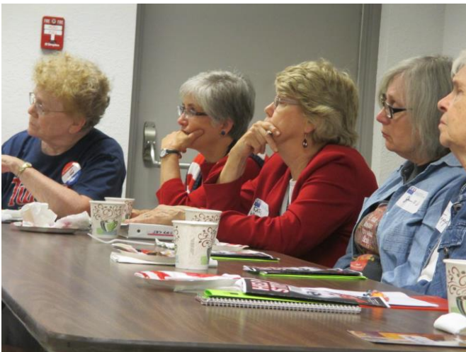
Audience listening thoughtfully