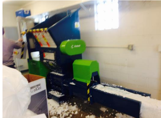
Coon Rapids Styrofoam Recycling Machine