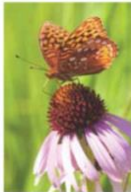
A great spangled fritillary (Speyeria cybele) on a pale coneflower.