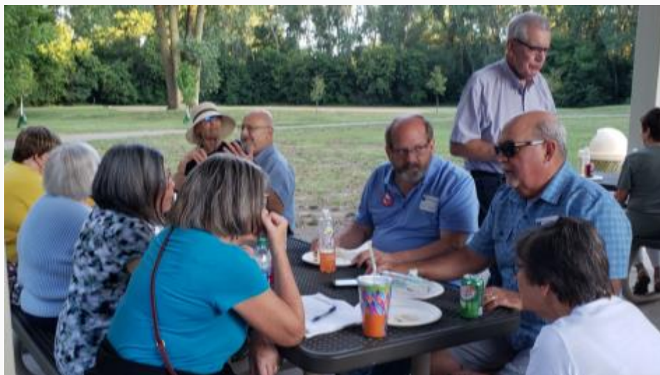
Annual picnic 2022.