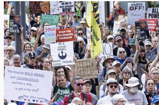
Photos (above) of the Minneapolis Good Trouble Lives On are from Instagram @handmaids_of_mn (photo by@guru_merc) and @indivisible_twincities