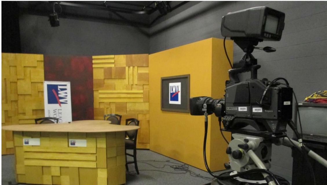
Blast from the Past - 2014 Candidate Forum Studio set.