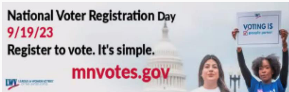
Our 2023 National Voter Registration Day billboard.