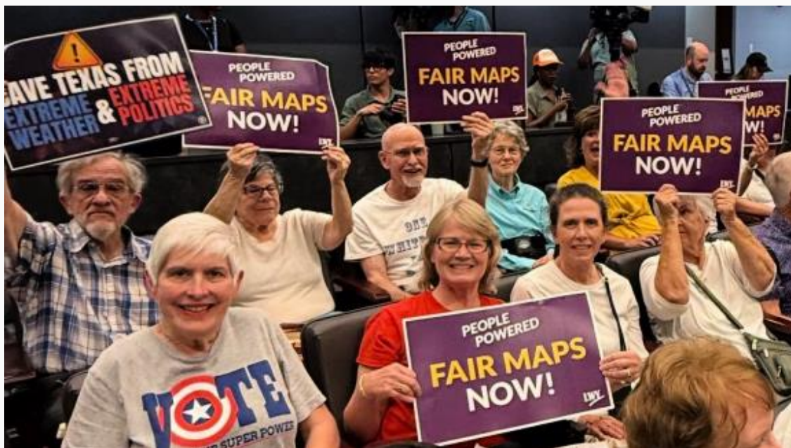
Redistricting public hearing in Texas.