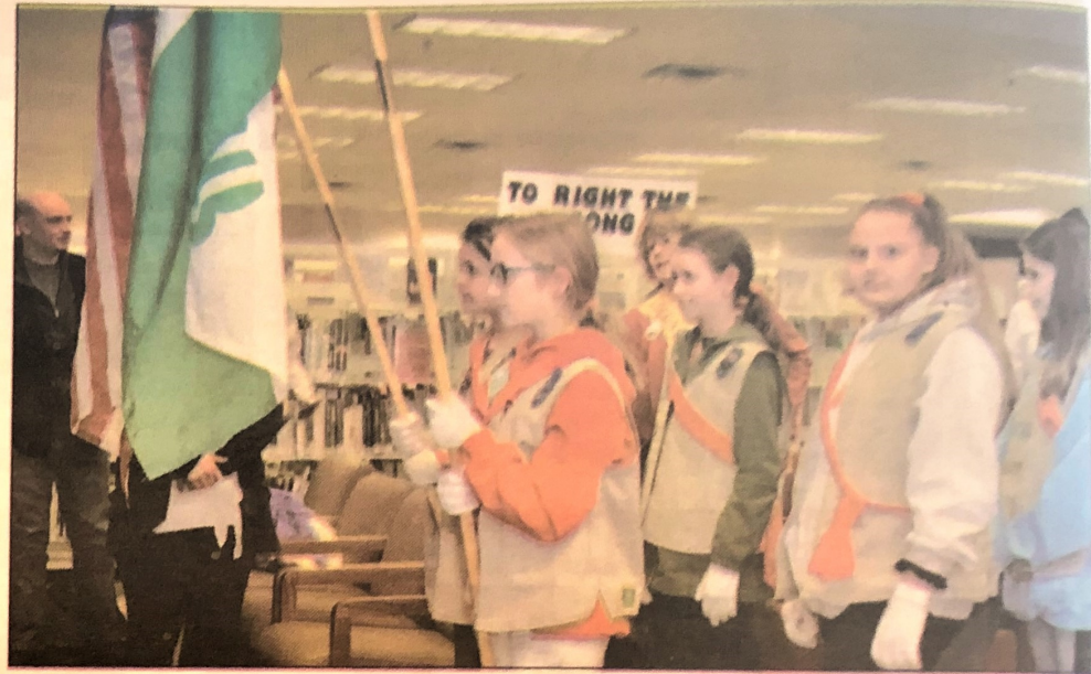
Girl Scout Troop 14629 presents the colors during the opening ceremony of the Century of Civic Engagement traveling exhibit at the Northtown Library Jan. 13.