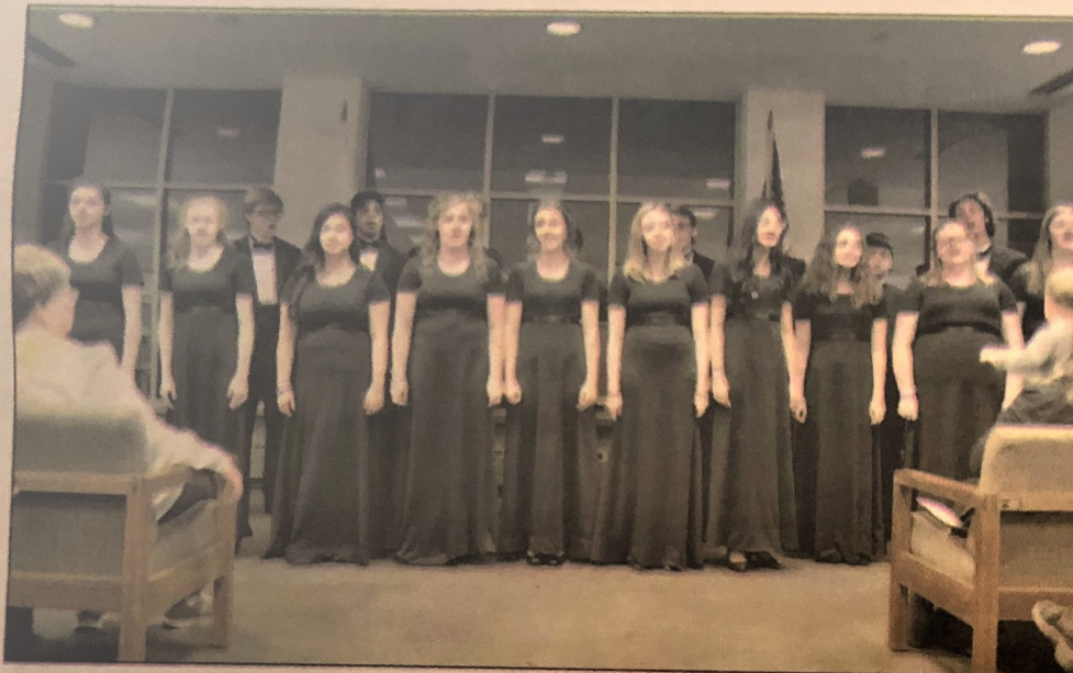
The Blaine High School choir sings during the opening ceremony of the Century of Civic Engagement traveling exhibit at the Northtown Library Jan. 13.