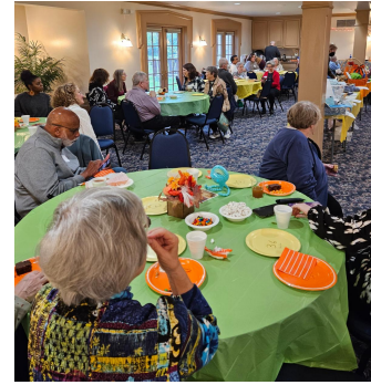
Attendees ready to bid at the Auction at Greenmead Historical House