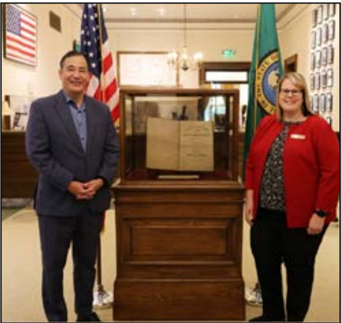
Washington Secretary of State Steve Hobbs and State Archivist Heather Hirota with the original 1889 State Constitution , September 14, 2023

Visitors to the display could read these approval telegrams on faded and hand-written scraps of paper. These crucial telegrams were the only