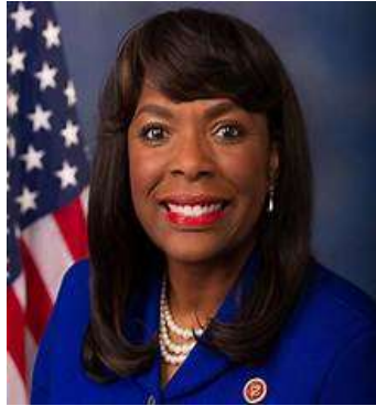
Representative Terri Sewell, D. Alabama

"We thank Rep. Terri Sewell for leading this fight to protect our democracy. We urge our elected leaders to work together in a bipartisan way to pass the John Lewis Voting Rights Advancement Act ..."