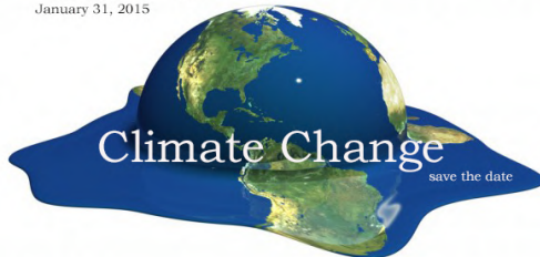
Bay Area League Day 2015 January 31, 2015