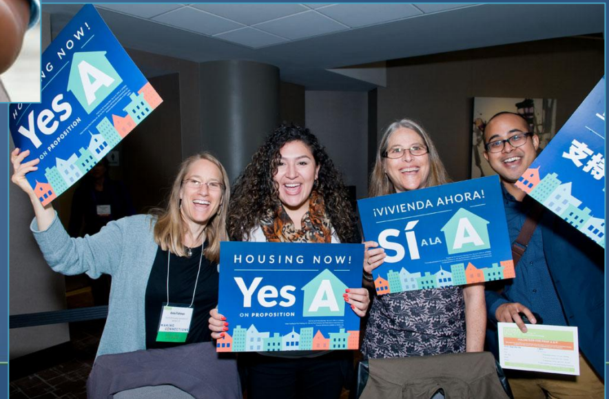
Members, residents, board & staff