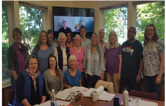
2018-2019 LWVHC Board Photo

The League of Women Voters, a nonpartisan political organization, encourages informed and active participation in government, works to increase understanding of major public policy issues, and influences public policy through education and advocacy.