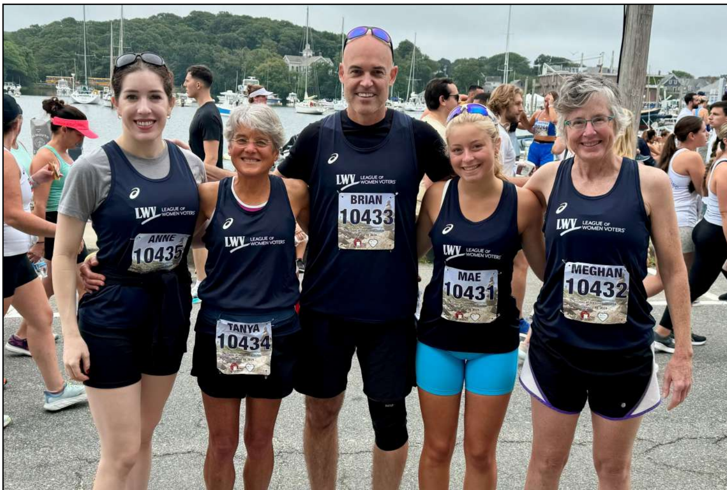
Our League of Women Voters of Massachusetts team for the Falmouth Road Race.