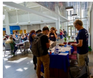
National Voter Registration Day Del Tech Community College, September 25, 2018

A newly formed committee, the Statewide Election Committee, is an offshoot of Voter Services and was initiated to review Delaware State Election practices. The committee met with representatives from the Organization for Security and Co-operation in Europe, OSCE, to discuss the Mid-term Election. This organization has been enlisted by the US government to oversee the 2018 Mid-term Election.