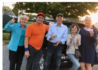
Georgetown Neighborhood Canvas October 1, 2018