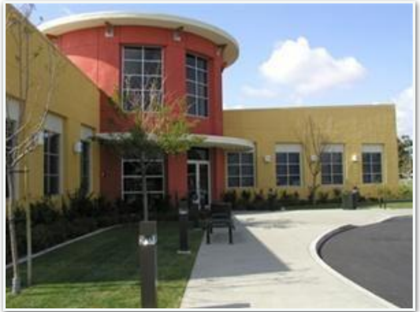
The Delhi Center in Santa Ana

The LWV Orange Coast is participating in this year's 36 th annual Great American Write-in sponsored by WOMEN FOR: ORANGE COUNTY. If you are interested in attending, it is on March 9, 2024, at the Delhi Center at 505 E. Central Avenue in Santa Ana. Participating organizations have desks and information where you can write to the decision-makers who can make a difference in health, the environment, peace, human civil rights, and education. More detailed information and location about the event is contained in the FLYER .