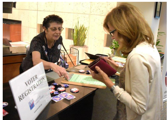
Voter Registration at Atmos Energy with LWV Dallas and LWV Collin County

LWV Dallas is already having talks with the North Dallas Chamber about hosting forums in the spring for city council and school board candidates, and we are also hoping to expand into other parts of town.