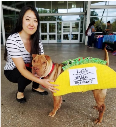
A Motivated Young Voter at Northlake College