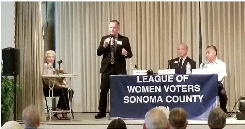
Sheriff's Forum at Graton

Clerk, Recorder, Assessor, Registrar of Voters Forum