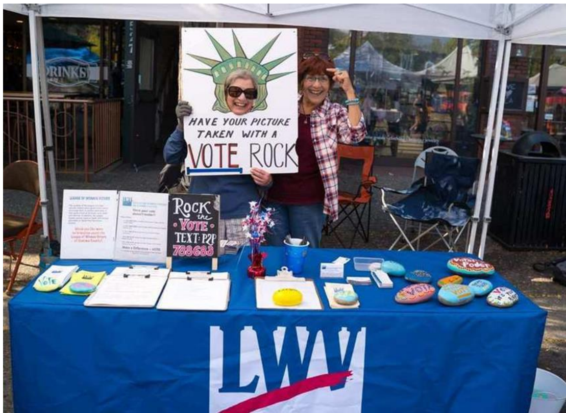
At the Aug 22nd Wed. Night Market where we distributed over 120 Government Guide s and over 100 Voter's Edge Bookmarks to the public.