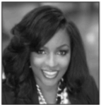
Jasmine Felicia Crockett (D) State Representative, District 100

REDISTRICTING: Yes, but we have got to go a little deeper than a nonpartisan commission. We need to make sure our potential commissioners are reflective of the communities we serve. We need people from diverse backgrounds. We must add an element of chance to this, as well, and vet those that are considered as commissioners to ensure that they have not been political operatives, lobbyists, etc. So for instance if there is a vetted list of potential commissioners that includes 100 names and if the goal is to get to 10 commissioners, we should then draw names. You see, too much is on the line for us not to add as many layers of protection to this process, as possible.