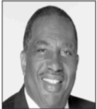
Royce West (D) United States Senator

OTHER ISSUES: What other issues do you believe will be most pressing in the next session of Congress, and what are your positions on these issues?