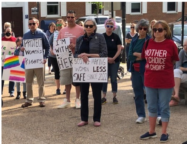
May 3 Rally at the Delaware County Courthouse opposing draft Supreme Court decision overturning Roe v. Wade . LWV-CDC was there. About 200 people attended.

See the LWV-CDC website for a fuller article and information on what you can do today.