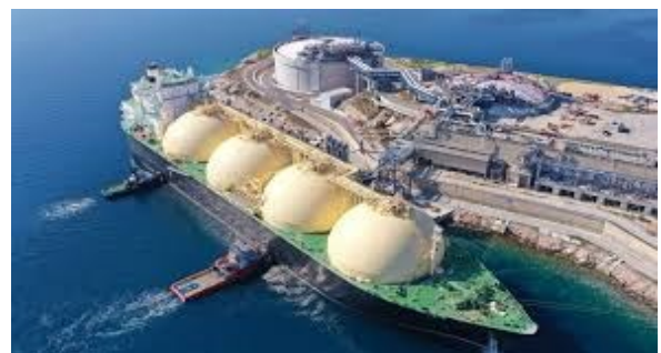
Generic Photo of LNG Export Terminal

LWVPA is very much in favor of RGGI as another powerful tool for mitigating climate change. It will be up to Gov. Josh Shapiro to decide whether to appeal to the state Supreme Court and he has been lukewarm on the initiative. There are also bills pending, but not moving, in the Legislature to curb the executive's power to establish new regulations, aimed directly at RGGI. You can read the court decision here .