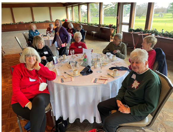
Some of our members at last year's gathering

brought on the day of the event). Cash at the event venue registration table, or online via the LWVDC DONATE button - click HERE .