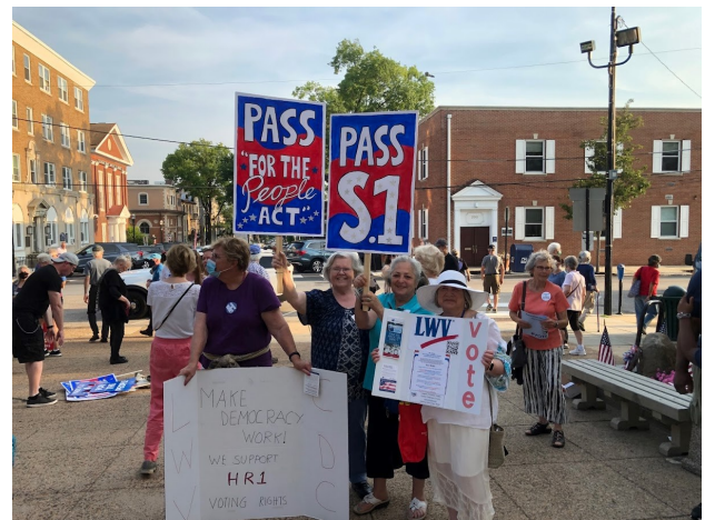
Our LWV-CDC Executive Board at the Aug. 6 rally

The once every 10 years reapportionment battle is in full swing and our sister organization, Fair Districts PA, is working hard to recruit voters to testify at public hearings being held by the House and Senate State Government Committees and to submit testimony and their own ideas for maps to the Legislative Apportionment Commission, which is made up of two Republic