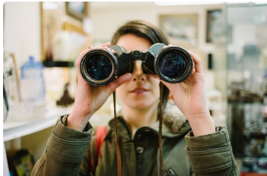
You won't need the binoculars

Two quick rules: wear your LWV buttons and do not make any public comments at the meeting.