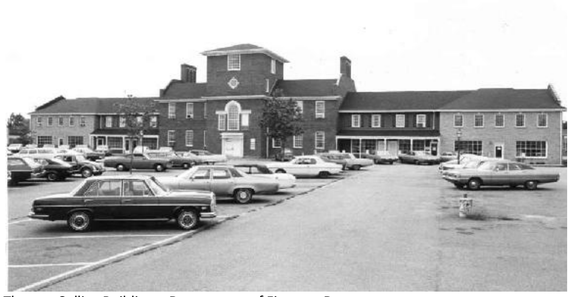
Thomas Collins Building – Department of Finance, Dover The following four divisions function as the Department of Finance:

Office of the Secretary provides economic data, revenue and legislative analyses and public information services. It provides the three operating divisions with managerial and technical leadership in achieving department-wide goals and overall coordination and management of all debt of the state and state authorities. In addition, the office builds the foundation for the state's general fund budget process by providing analysis and forecasting of revenues in support of the Delaware Economic and Financial Advisory Council.