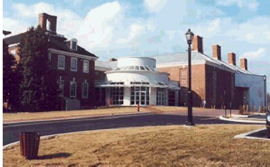
Delaware Public Archives - Dover

Division of Archives manages and protects Delaware government documents of permanent value and makes these records available to the public. The mission of the Delaware Public Archives is three-fold: to identify, collect, and preserve public records of enduring historical and evidential value; to ensure access to public records for present and future generations of Delawareans; and to advise and educate in the creation, management, use, and preservation of public records. <a href="http://archives.delaware.gov/aboutagency.shtml">http://archives.delaware.gov/aboutagency.shtml</a> (302-744-5000)