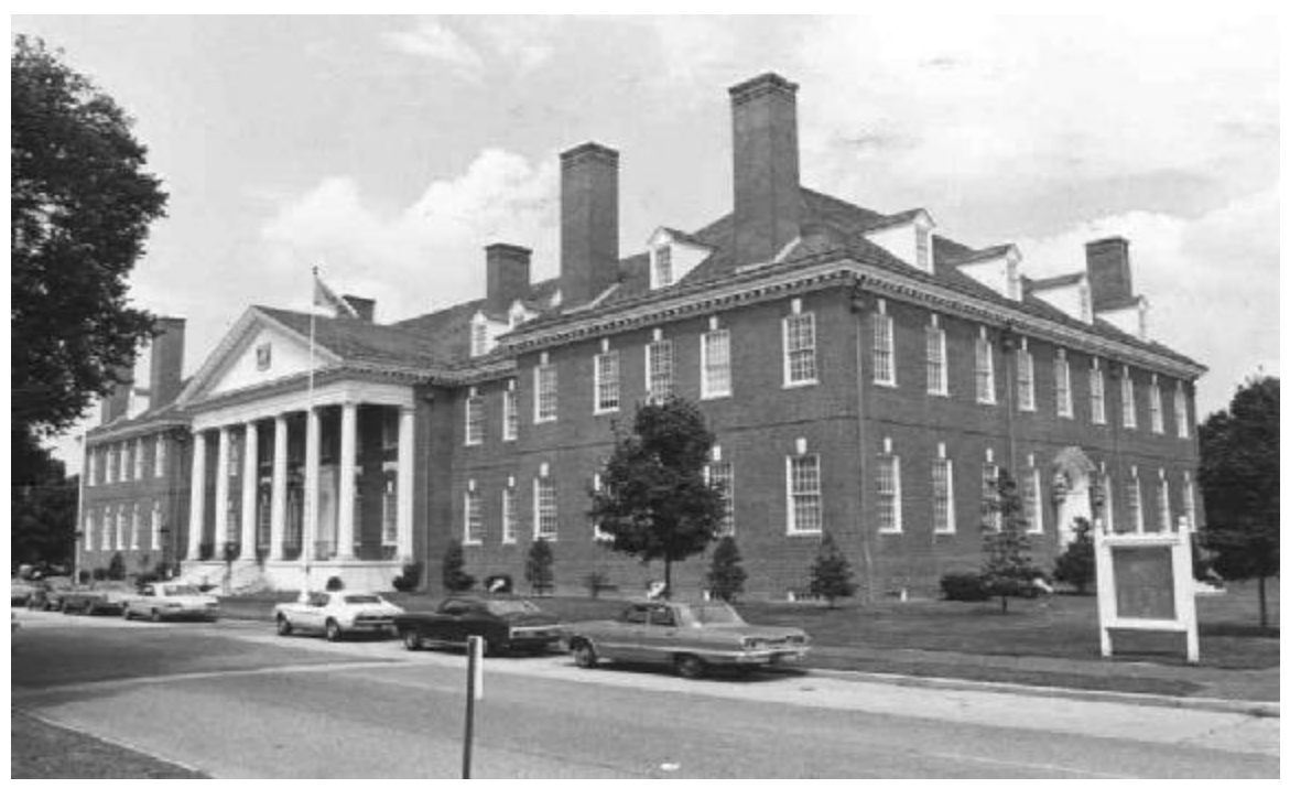
Townsend Building, Dover – serves the Department of State and other departments Department of Transportation (DelDOT)