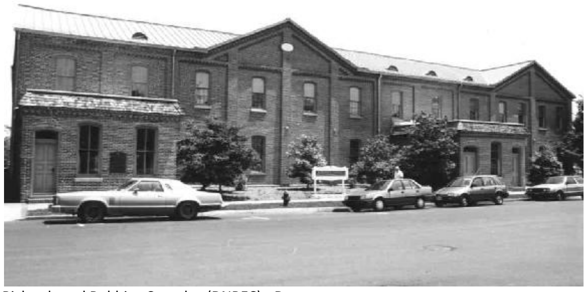
Richards and Robbins Complex (DNREC) - Dover

Division of Water Resources monitors, manages and protects Delaware's ground and surface waters, tidal wetlands and underwater lands. The division is a link to the Delaware Estuary Program, Inland Bays Estuary Program and the Delaware River Basin Commission, and provides centralized computer and geographic information system services. It also provides public education and outreach programs and coordinates citizen volunteer monitoring programs. <a href="http://www.dnrec.state.de.us/water2000/index.asp">http://www.dnrec.state.de.us/water2000/index.asp</a> 302-739-9950