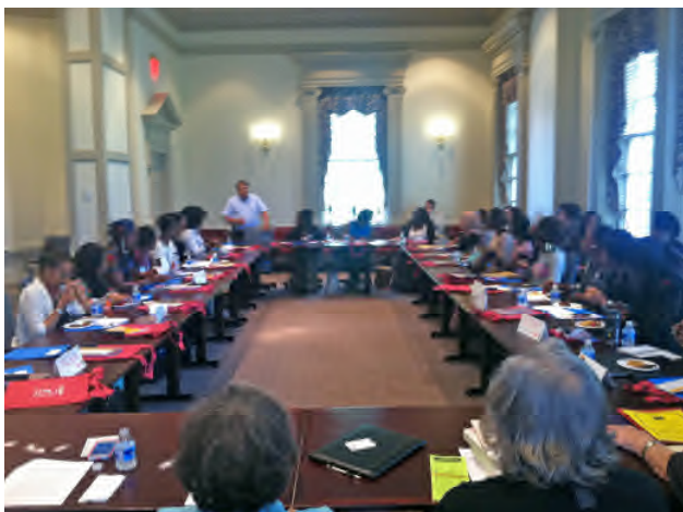
(Above) Roundtable discussion at Legislative Hall, Delaware (Below) Students posing on steps inside Legislative Hall