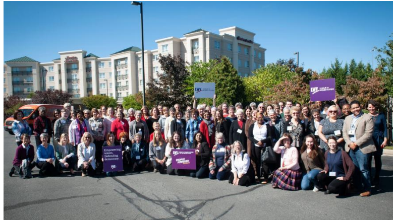
LWFV members leadership training for People Powered Fair Maps Campaign.

Accurate, comprehensive data is also used by private industry for such purposes as helping determine where companies bring new jobs.