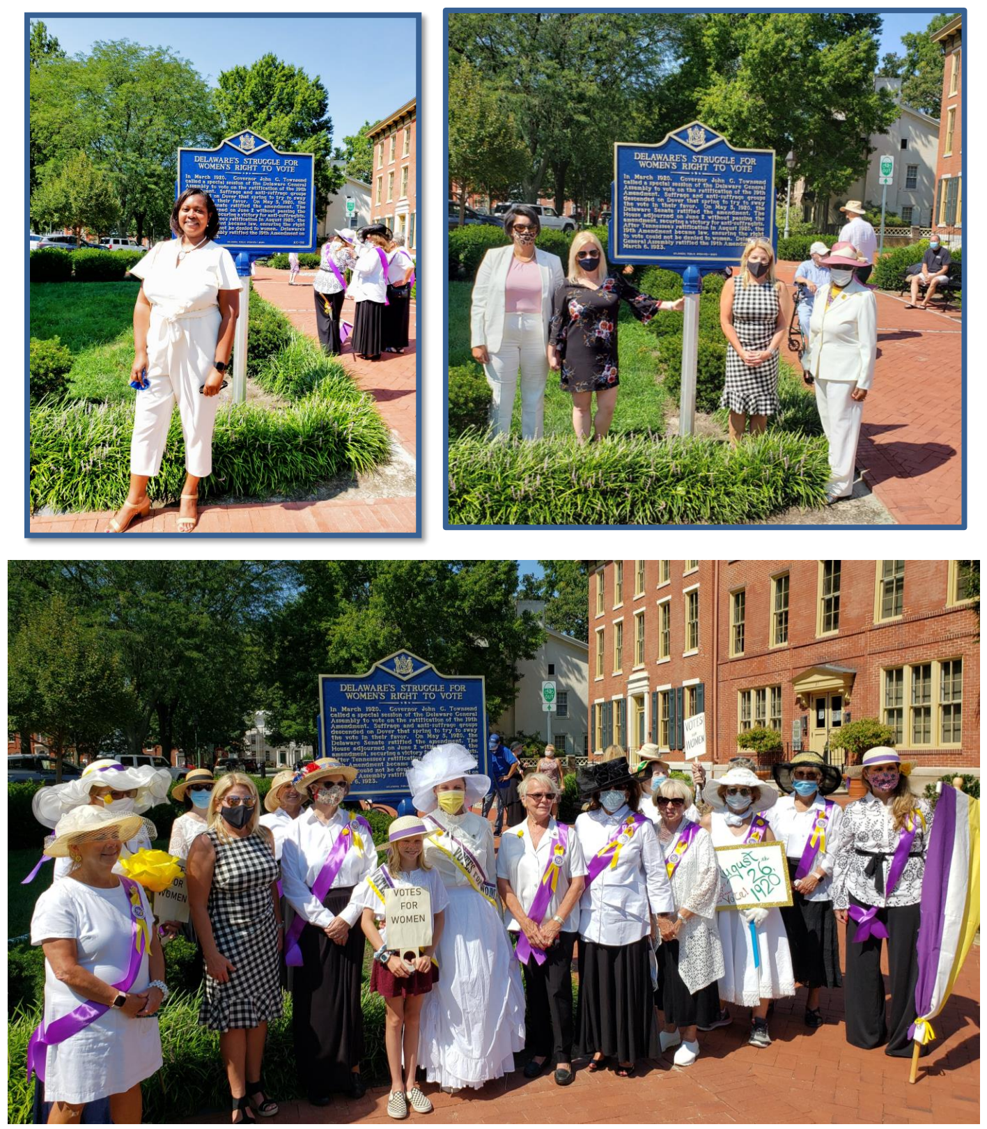
The Delaware Public Archives placed in historically significant locations and sites across the state, markers on commemorating the anniversary of the passage of the 19<sup>th</sup> amendment. The Kent County marker is located next to the Old State House on the Green, Downtown Dover.