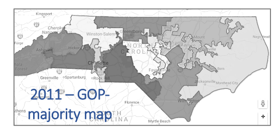
Both parties have gerrymandered NC

Politicians now use sophisticated computer programs to choose their voters more precisely than ever. They don't have to compete for your votes: the maps make the winners almost a foregone conclusion. Voters can't hold their representatives accountable. This isn't how democracy is supposed to work: voters should choose their representatives, not the other way around!