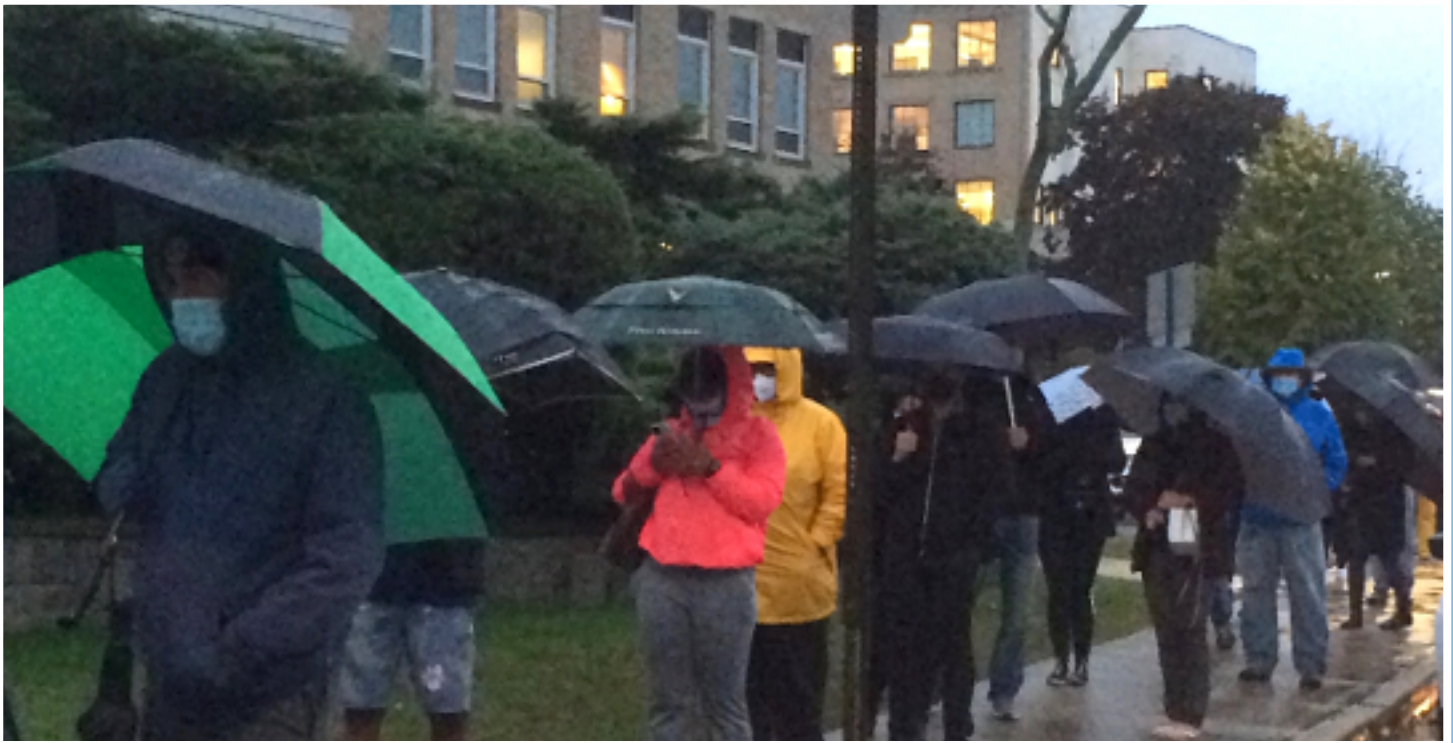
VOTERS WAITING IN THE RAIN OUTSIDE CITY HALL ANNEX ON OCTOBER 29

VISIT US ON FACEBOOK https://bit.ly/3bdvuwT