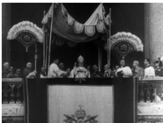
This still from a 1959 Univision Newsreel shows Pope Pius XII on the balcony of the Basilica of Saint John Lateran, Rome, Italy.

Holy Silence is a new thought-provoking documentary that examines the individuals in the United States and across Europe who played a crucial role in shaping the Vatican's response to the rising Nazi threat across Europe.