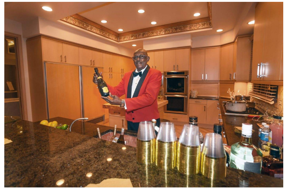
Drinks at your service