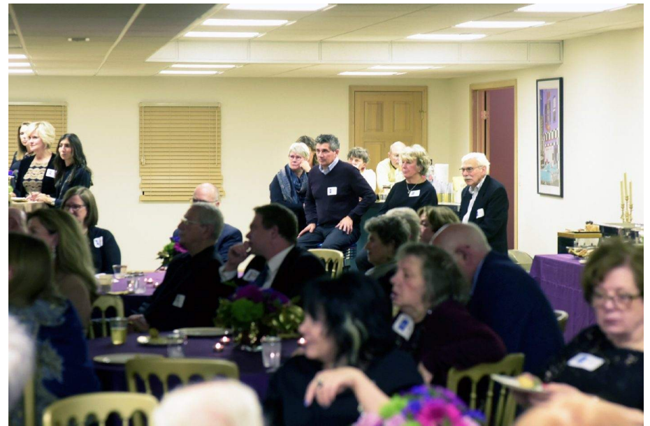
The Bar Crowd