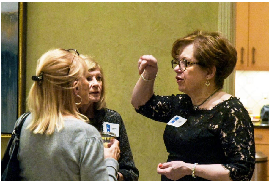
Making a point