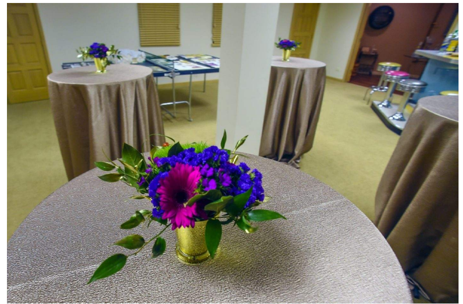
ArtQuest flowers make such a difference