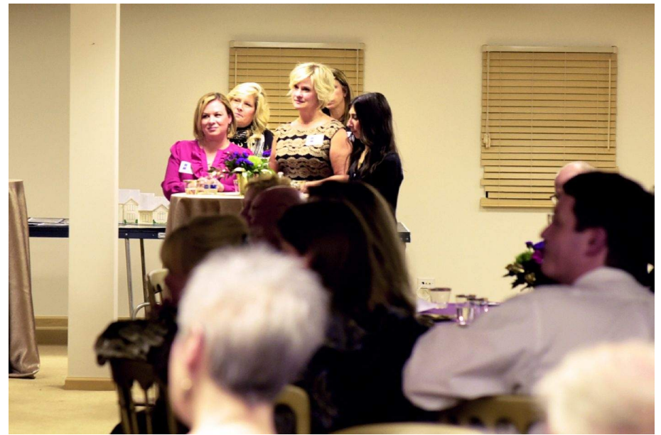
Attentive stand-up crowd