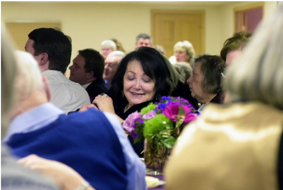
Enjoying the speakers