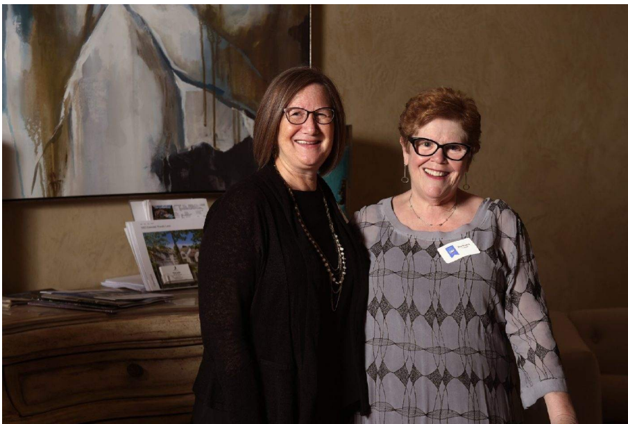
Current and former Presidents LWVIL