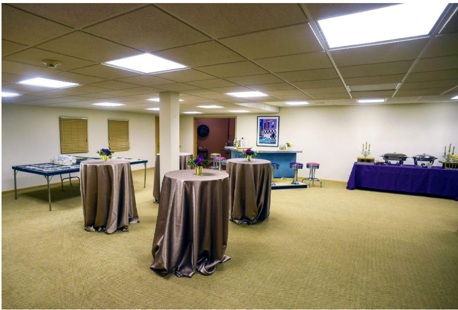
Anticipating a great turnout