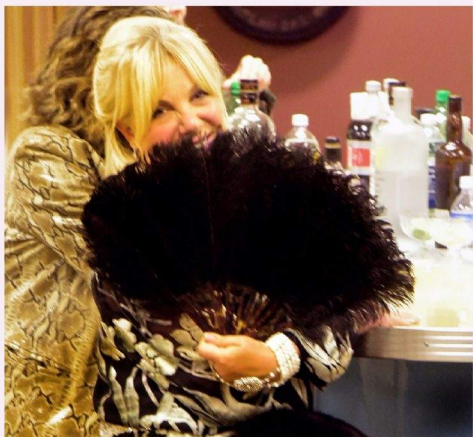
Hostess with the Mostest