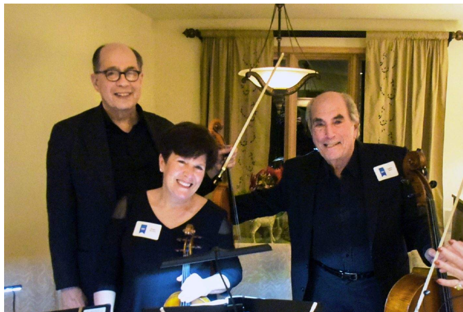
Highland Park String Trio