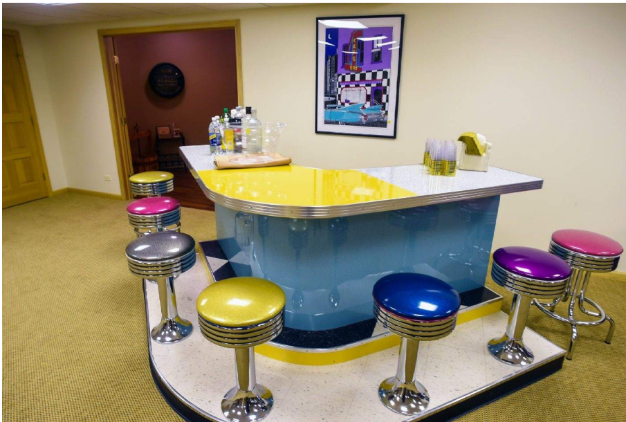
Not complete without the bar or is it a soda fountain?