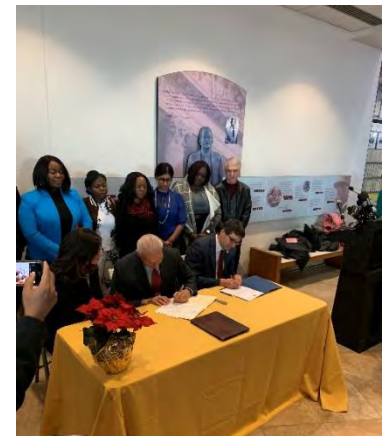
Pictured above L-R seated:

And, so we continue the work of the past 100 years! Get active! Join the journey!