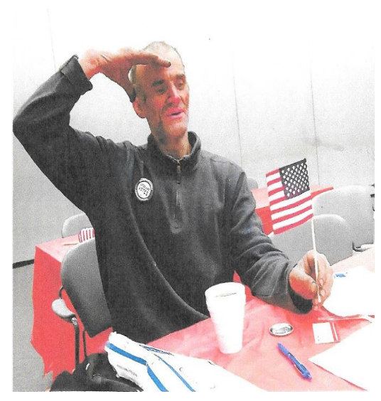
New voter at downtown ballot party.

This October and November, LWVSA members offered several Get-Out-the-Vote activities to engage, empower and inspire everyone to vote. League members reached out to the general public and conducted a pilot project to engage underrepresented populations.