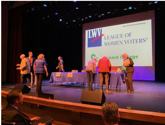
The "roadies" get setup for the forum.