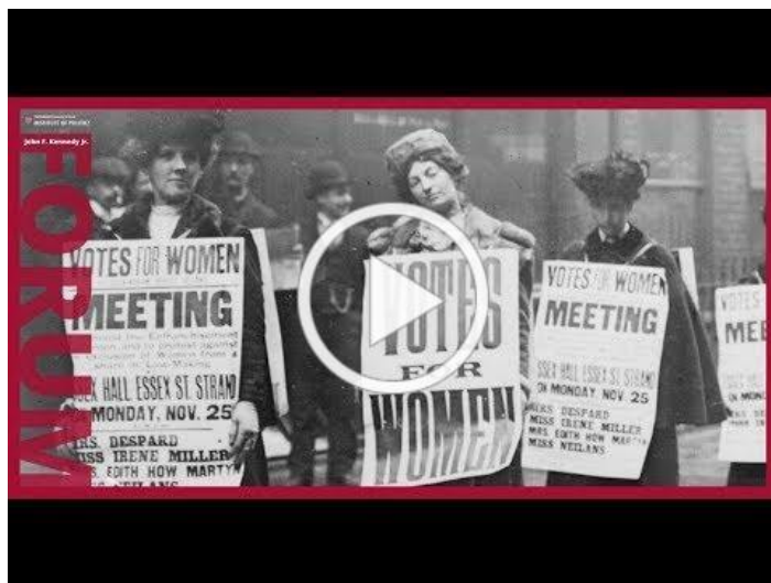
Fighting for Political Power: Women's Inclusion from the 19th Amendment to 2020

On an all-female panel discussing political power and women's inclusion, Virginia reminded the audience of students and attorneys that women were not 'granted' the right to vote. "The hell they were! Women fought hard. It was a hard-fought battle" to win the vote. If the embedded link doesn't work, click here: https://youtu.be/pSF-u8X4n-A