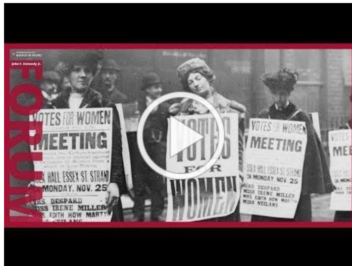
Fighting for Political Power: Women's Inclusion from the 19th Amendment to 2020

On an all-female panel discussing political power and women's inclusion, Virginia reminded the audience of students and attorneys that women were not 'granted' the right to vote. "The hell they were! Women fought hard. It was a hard-fought battle" to win the vote. If the embedded link doesn't work, click here: https://youtu.be/pSF-u8X4n-A