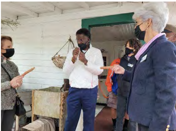
Above and Right—more pictures from the Black Heritage Museum/