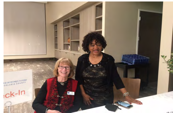
Left and above: more pictures from "Thurgood" performance.