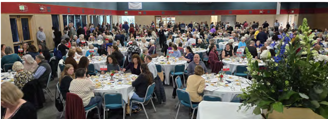
The League welcomed a record number of people to the 33 rd State of the Community Luncheon, its major fundraiser. Attendees included League members, business leaders, elected representatives, volunteers, and friends and family of the Civic Award winners.