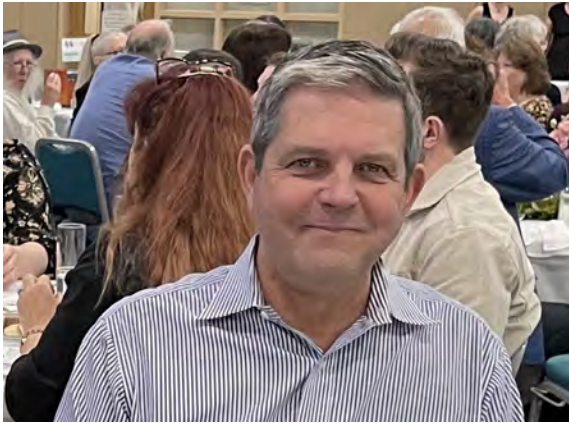
Assembly Representative Jim Wood