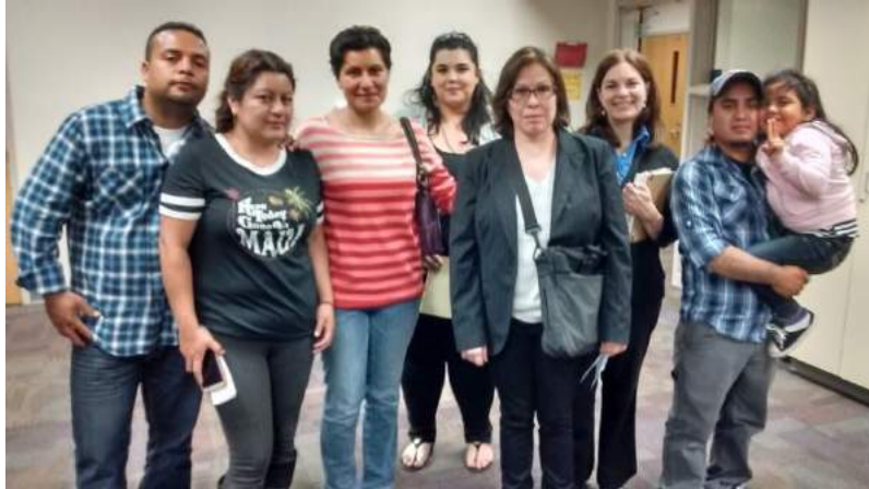
Fridley Latino residents in an ISAIAH leadership program in attendance at October 4 Candidate Forum at Fridley Community Center.