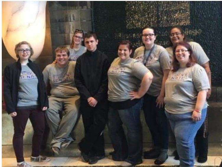
The Anoka-Ramsey Community College student senators who attended the MSCSA conference

I encourage other members to get to know these highly motivated active millenials!