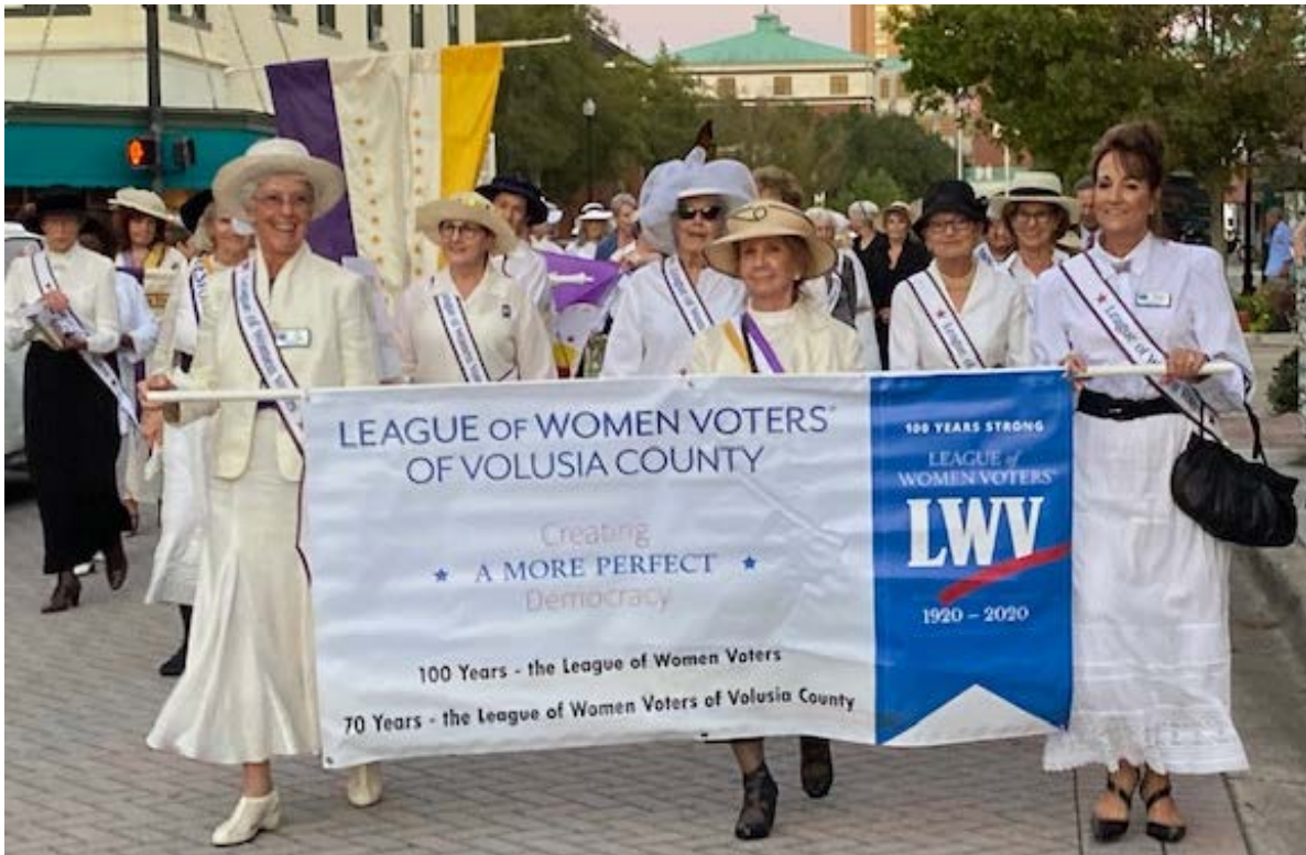
League of Women Voters Members, dressed in period attire, march the streets of Deland to the showing of “Ladies Taking Liberty” at the Athens Theater.