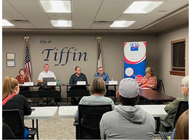
Above Left: Scenes from the Iowa City City Council candidate forum on October 16. Above Right: The Tiffin Mayor and City Council candidate forum on October 23.