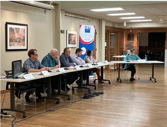
Below Left: The ICCSD School Board candidate forum on October 18. Below Right: The North Liberty City Council candidate forum on October 25.