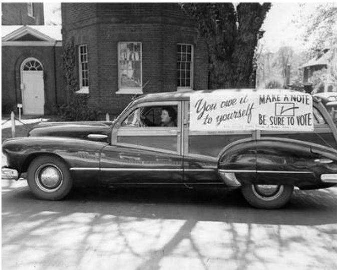
Left: Someone was rummaging through the LWVUS historical photos and came across this gem with a timely message –