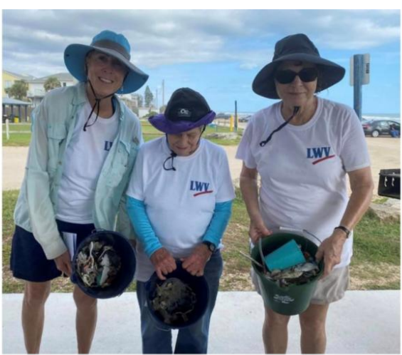
Beach Cleanup Crew