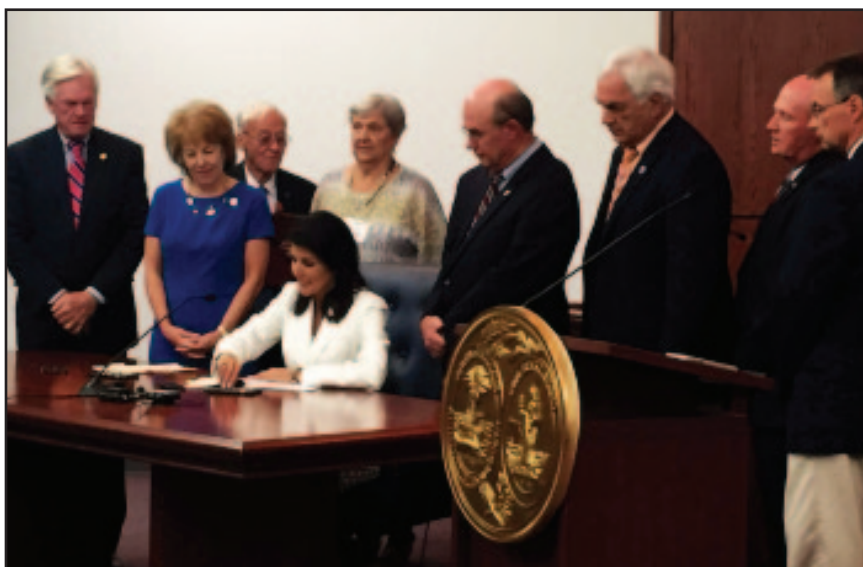
On June 23, 2016, Governor Nikki Haley signed two ethics reform bills into law: Income Disclosure and Independent Investigation .