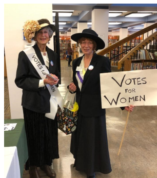
Get Out The Voter-Partner with AAUW Nov 2, 2019