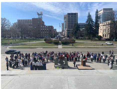
Ring the Bell, Boise Idaho Mar. 13, 2020