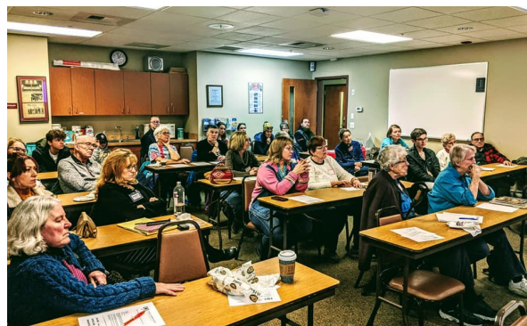
"Suppressed" Documentary Audience