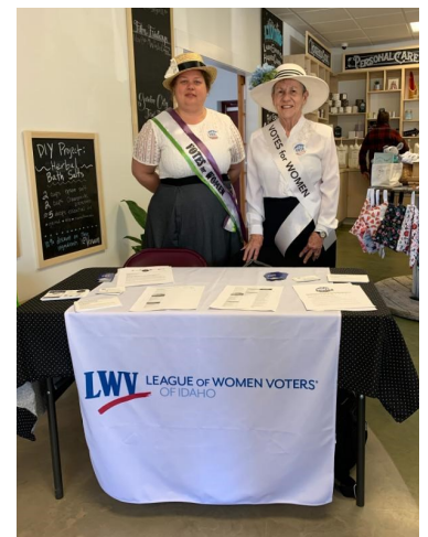
GBAM Unit – Get Out the Vote 5