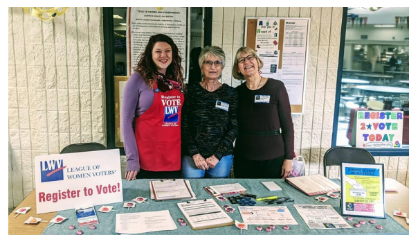
Day of Action.