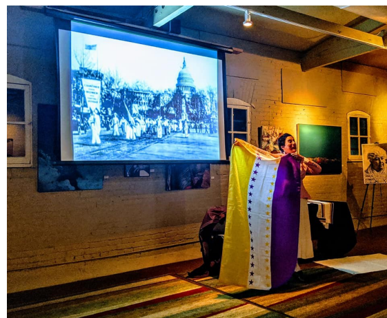
Hear my Voice presentation.