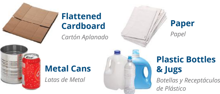
Flattened Cardboard Cartón Aplanado

COLOQUE sólo estos artículos en el contenedor de reciclaje