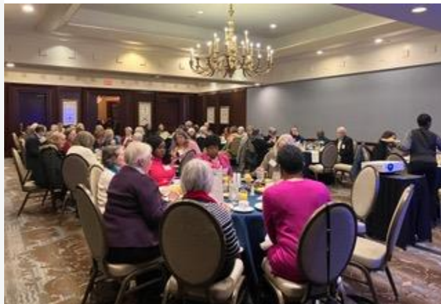
At breakfast with our 71 participants

Despite record cold in Richmond, almost all of the 71 people who signed up for League Day showed! Yes, we had a few dead batteries and some people down with colds but we lost no more than the average number of people who can't attend these events at the last minute. You guys are amazing!!!!!! We persist no matter the conditions and we let them hear us at the General Assembly