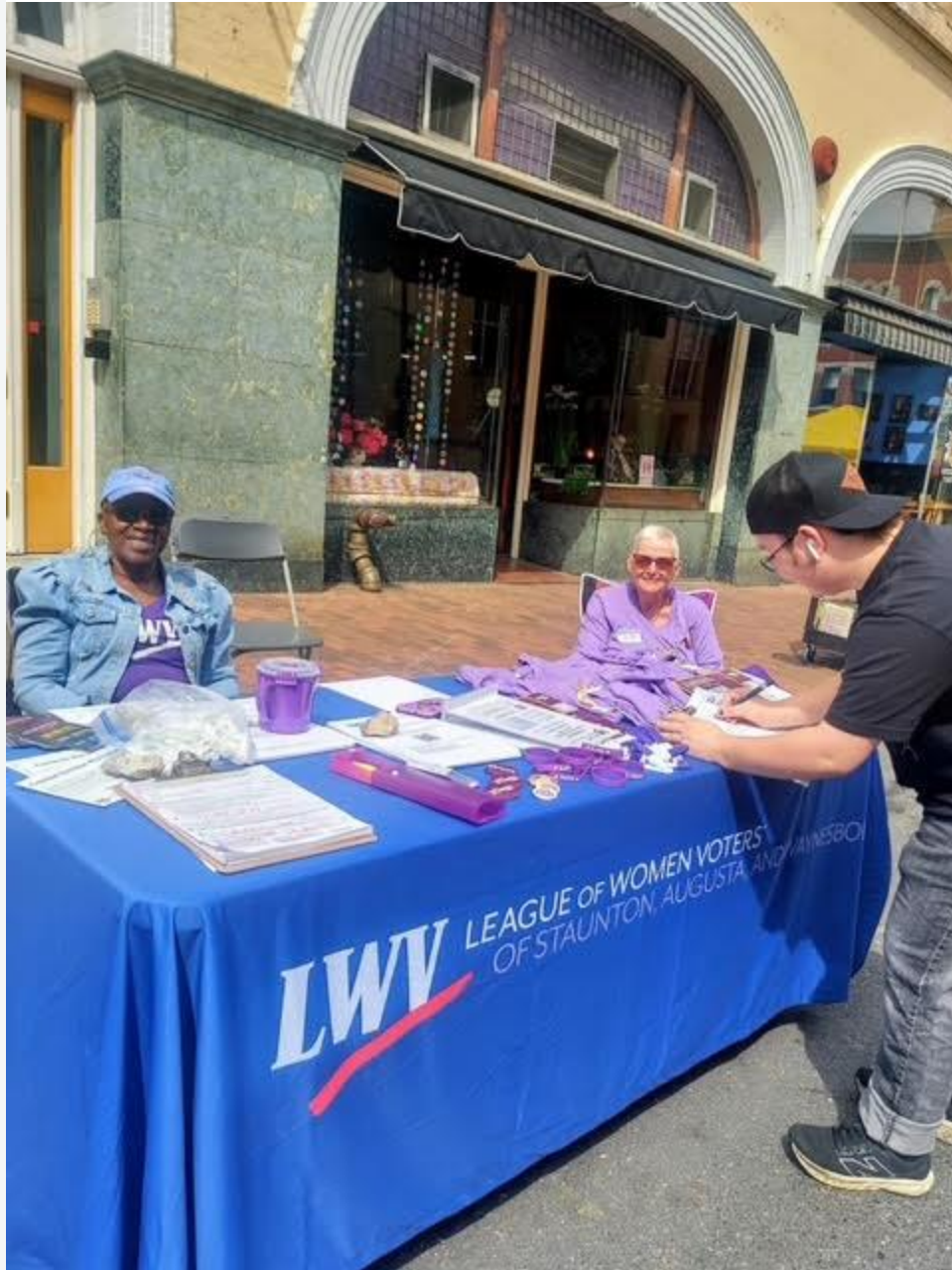
The League of Women Voters of Staunton, Augusta, and Waynesboro (LWV-SAW) proudly partnered with Student Engagement at Mary Baldwin University to support voter registration and civic engagement.