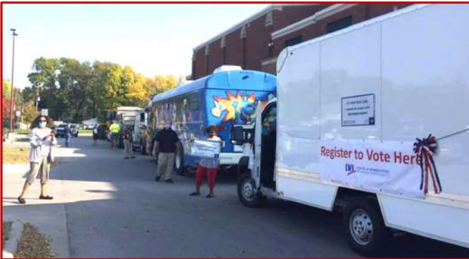
At the Census Caravan, advocating for the vote.

LWV-ASC thanks Deery Brothers of Ames for their generous contribution of our “Voter Van” which enabled us to take our message throughout the City and County. The crew put some miles on it, and it made an impression on the public as it rolled into the various sites. It was also in the Census Caravan, a non-partisan effort to ensure that Ames gets its fair share of funding and representation.