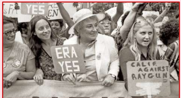
Activist and US Representative Bella Abzug in 1974

The Equal Rights Amendment ratification extension has come up before the national legislature every year since its inception, but discrimination on the basis of sex is still not prohibited by our Constitution. Iowa ratified the Amendment in 1972. At this time the US House has passed a resolution to extend the ratification deadline. The US Senate has not. Contact your senators to make your views known.