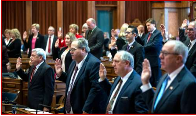
New legislators are sworn in, January 2020

The LWVIA Board and its lobbyists met on November 11 to finalize and prioritize the issues for which LWV will be advocating and lobbying during the upcoming Iowa legislative session, which begins January 11. Here are the priorities: