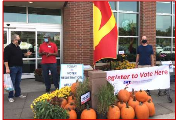
With the NAACP on September 26