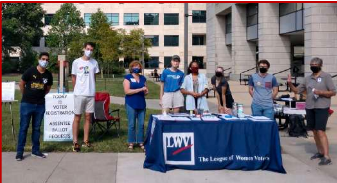
On Campus with IVOTE and ISU Democrats August 14

During National Voter Registration Day and weekend the visits included the ISU Campus, St. Thomas Aquinas parking lot, the 3C’s building in Huxley, and on September 24 again at the St. Thomas parking lot.