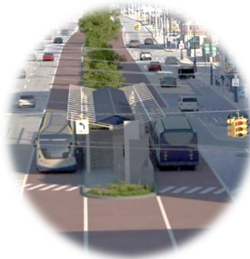
Rapid Bus Transit Station Simulation

The RTA will share a presentation about the Regional Master Transit Plan followed by a session to take your comments and answer questions.